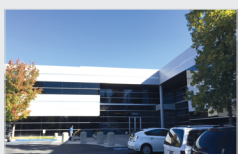
Brea (USA) – American Headquarters

TSC America Inc. 3040 Saturn Street, suite 200 Brea, CA 92821 USA