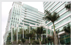
Taipei (Taiwan) – Global and Asian Headquarters

Taiwan Semiconductor Co., Ltd. 11 Fl., No. 205, Sec. 3, Beishin Rd. Xindian Dist., New Taipei City, 231 Taiwan R.O.C.