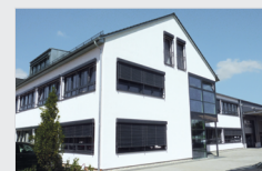
Munich (Germany) – European Headquarters

Taiwan Semiconductor Europe GmbH Georg-Wimmer-Ring 8b 85604 Zorneding Germany