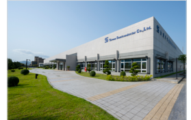
Li-Je (Taiwan) – Frontend Facility