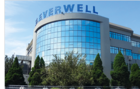
Tianjin (China) – Frontend Facility