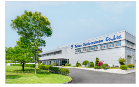
I-Lan (Taiwan) – Backend Facility